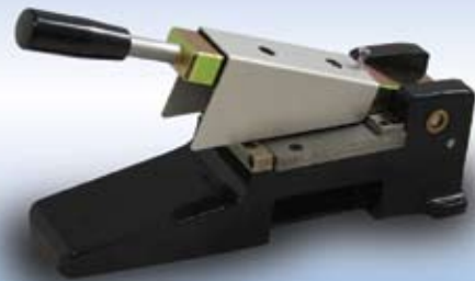
FREE SAMPLE CUTTER

Evaluate and control alternative substrates